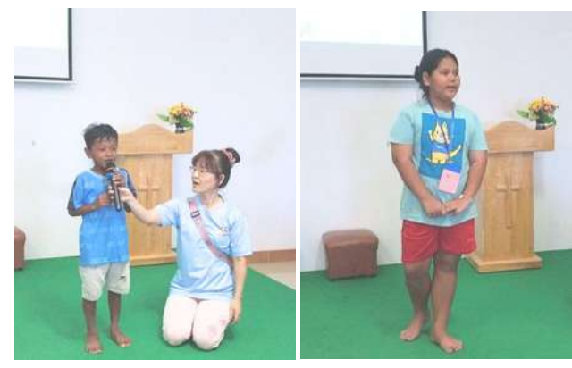
Children presenting memorized verses

them in their hands and that the network of support will further expand.