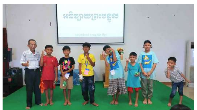
Stamps on leader cards filled up, Children who received prizes as a reward

Group picture with completed crafts in hand